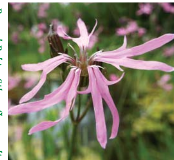
Ragged Robin, Silene flos-cuculi

Boundary Brook Nature Reserve has been leased by Oxford Urban Wildlife Group from Oxford City Council since 1990.