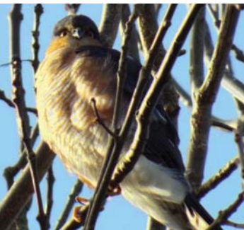
Sparrowhawk, Accipiter nisus

We offer Forest School activities on site and welcome school and other young people's groups to visit. Follow our Connecting in Nature project supported by the National Lottery Community Fund: