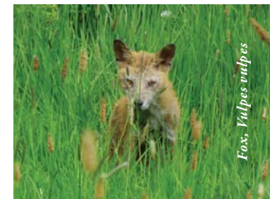
Fox, Vulpes vulpes

The three acre reserve is a delicate mosaic of wildlife habitats featuring mixed native woodland, scrubland and hedges, beautiful freshwater habitats, grassland and a demonstration wildlife garden and Forest School.