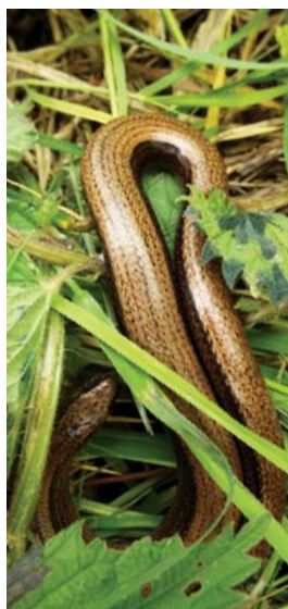
Slow worm, Anguis fragilis

Oxford Urban Wildlife Group have created and maintain a nature reserve with a rich variety of habitats including woodland, pond and meadows. This exciting, award winning project provides opportunities for other groups to visit the site for inspiration and learning. We give advice on practical projects and wildlife queries.