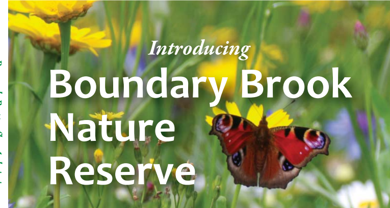
Peacock Butterfly, Aglais io on the Cornfield

Printed on 100% post-consumer recycled paper by Seacourt